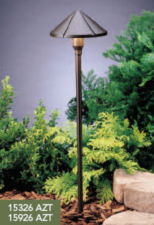
15326 AZT 15926 AZT